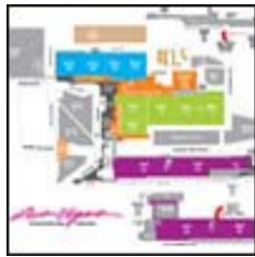
LVCC Overview Map

Free wireless Internet access available in all common lobby areas in the convention center and in Luckys restaurant in the Grand Lobby and the Aces Restaurant in the South Hall.