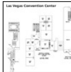
LVCC Hall & Room Locations