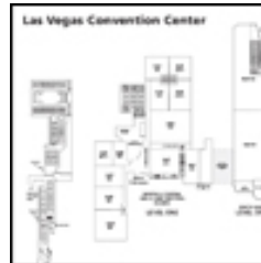
LVCC Hall & Room Locations